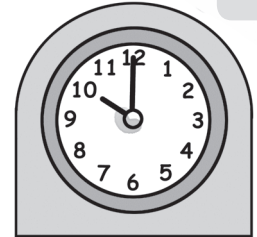
4 It's _____.