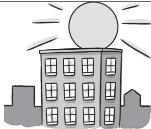
2 a _____