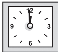
2 It's _____.