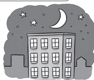
3 n _____