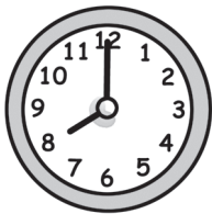
1 It's eight o'clock .