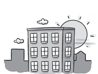
4 e _____