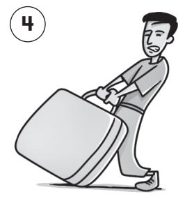
silly / pull