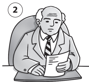
boss / secretary