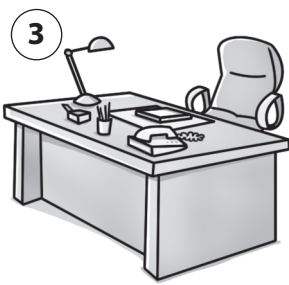
office / sausages