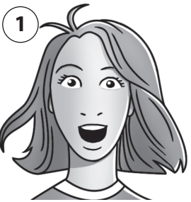
surprised / wish for